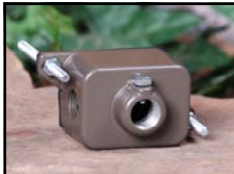
Tree Mount Box