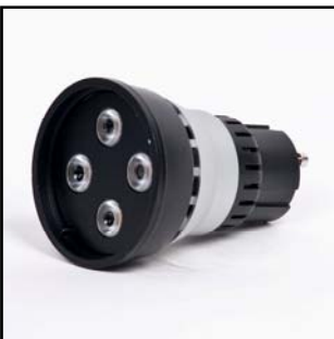
LED MV12V R20 2.5W 5K FL

LED Lamp Included: 4 Low heat-emitting LEDs operating at .5 watts each. No UV light radiation, paired with excellent heat sinks, provides a 50,000 hr. expected lamp life and 3 year warranty. Solid state LED direct lamp replacement technology. LED Lamp is not dimmable. Available in 40° (FL) beam spreads in Cool White and Warm White.