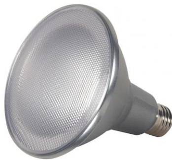
Satco 15W LED lamp